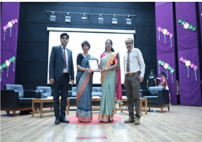
Felicitating the Resource Persons of the Conference