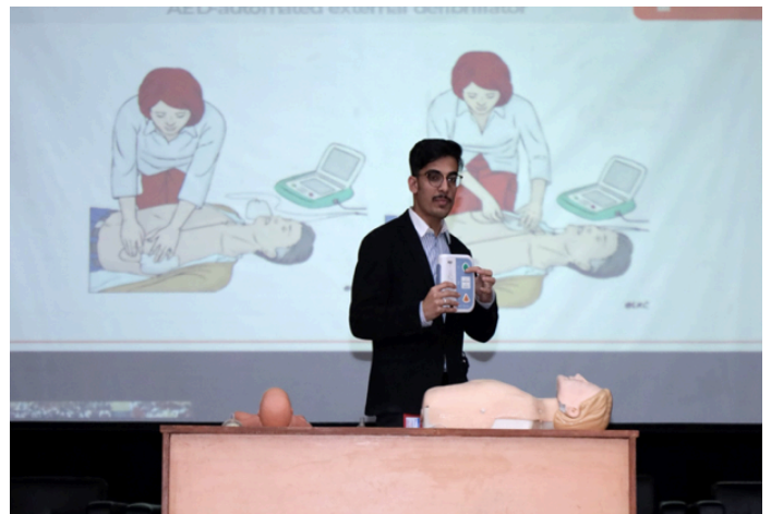
Workshop and Hands on training on Cardiopulmonary resuscitation (CPR)