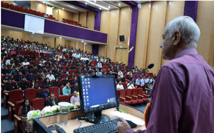
The Honourable Pro Chancellor addressing the delegates during the Inaugural session of the Conference.

Amity Institute of Pharmacy, Amity University Madhya Pradesh, Gwalior , organized a National Conference on "cardiovascular diseases: Prevention, Management, and Treatment" on the 9th and 10th of April 2024. This gathering aimed to tackle the challenges, advancements, and best practices in combating CVDs, which persist as a leading cause of morbidity and mortality worldwide. Through collaborative discussions, presentations, and workshops, participants shared knowledge, insights, and strategies to bolster cardiovascular health outcomes and alleviate the burden of CVDs.