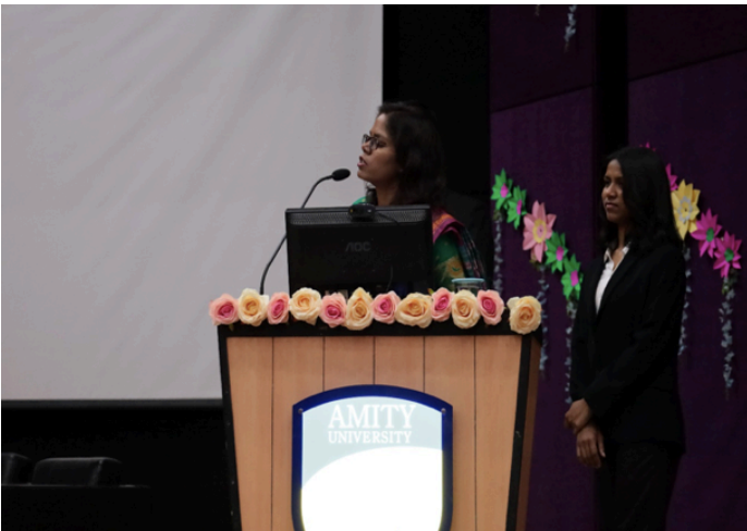
Delegates interacting with the Resource persons.