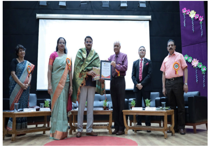
Felicitating the Chief guest of the Conference