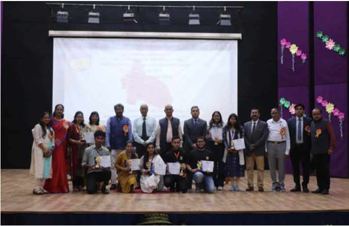
Winners of Scientific sessions of the Conference