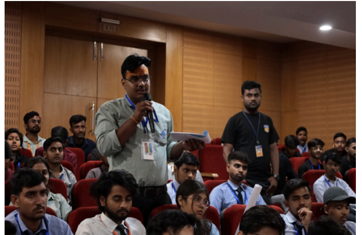
Delegates interacting with the Resource persons.