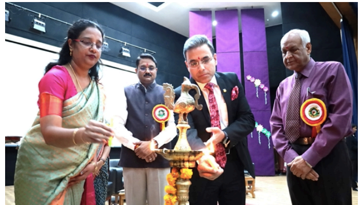
Lamp Lighting Ceremony