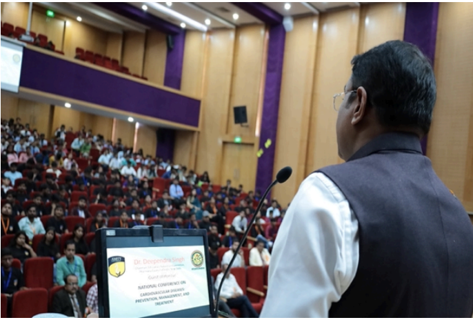
The Honourable Chief guest addressing the delegates of the Conference.